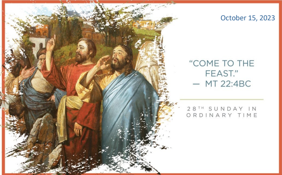
EXCERPTS FROM THE LECTIONARY FOR MASS ©2001, 1998, 1970 CCD. ©LPI